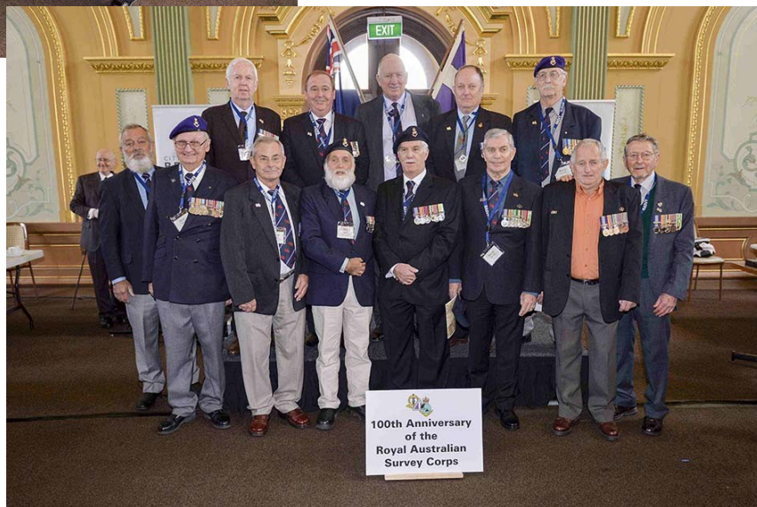
Ex Vietnam participants