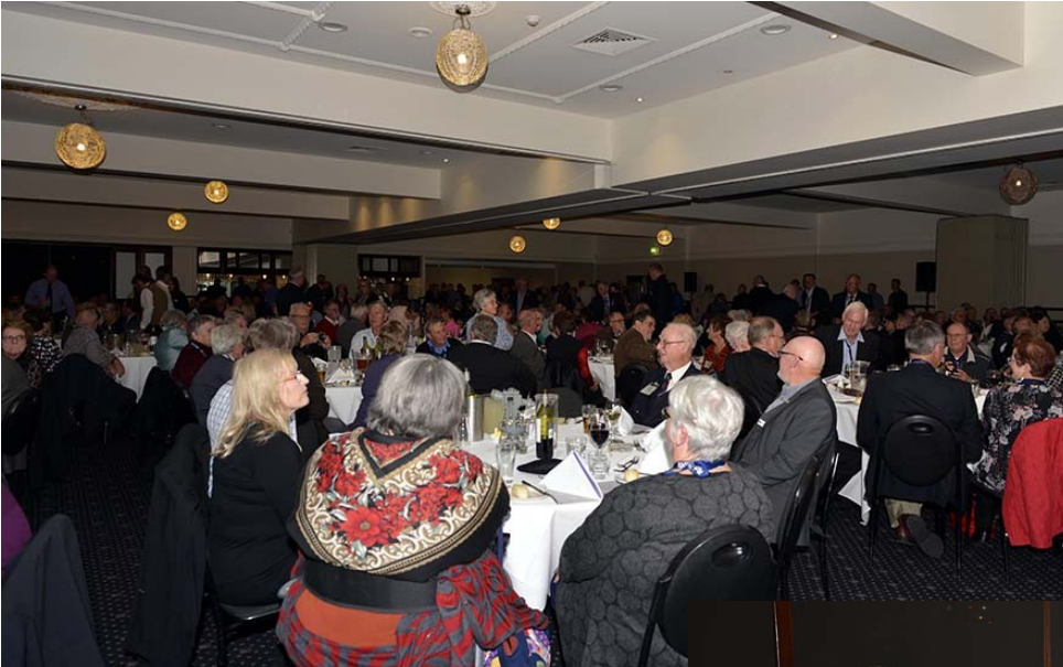
At the All Seasons Dinner

Their sign says it all !!!, the "Arty Farty" Illustrators having a good time