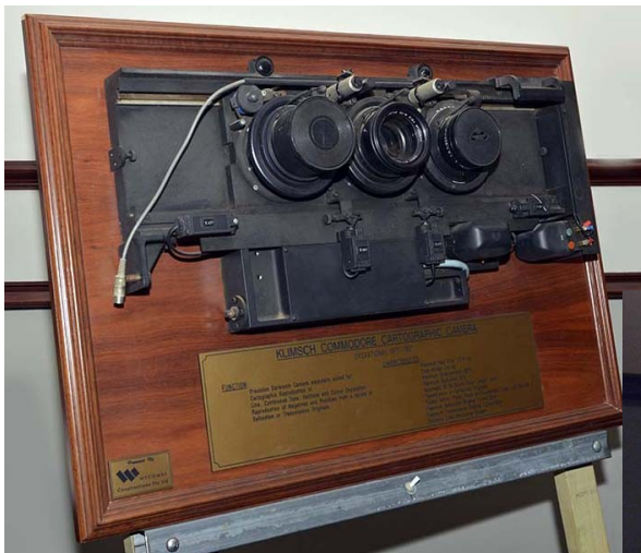
The lenses from the Klimsch Commodore Camera