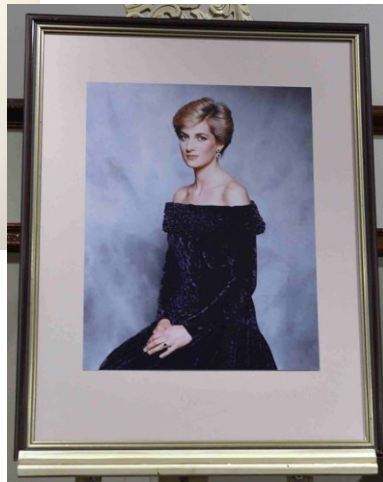
HRH Lady Dianna, the Princess of Wales