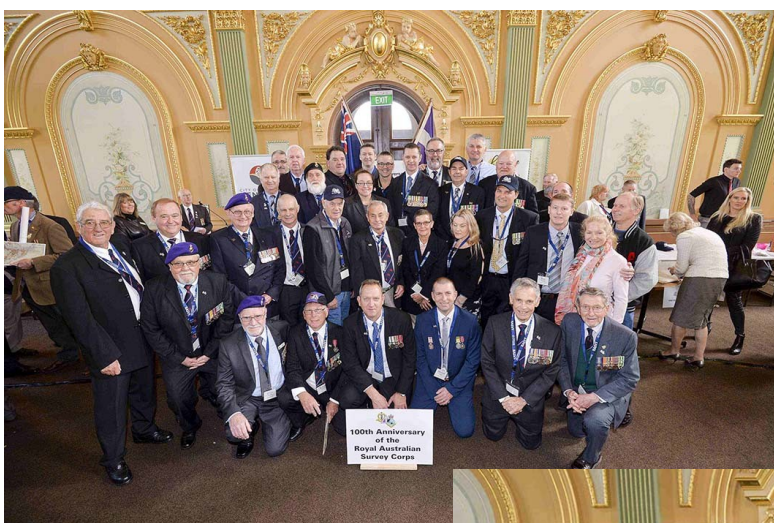
Members/Ex members of 1 Topo Svy Sqn