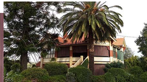
High tea at Turriff.