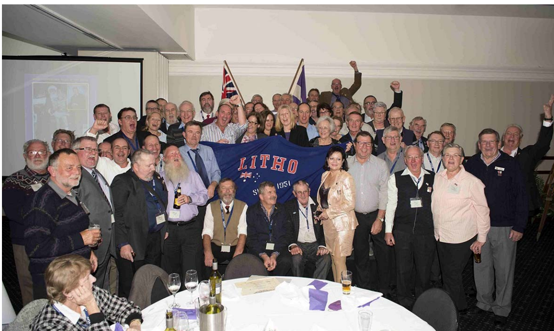
And of course..... "Litho"